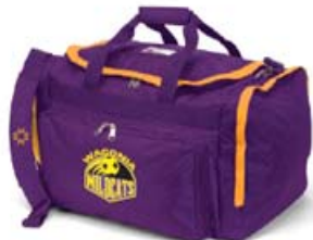
Duffle Bag 22" x 12" x 13" = $27.00

Waconia Community Education now offers apparel for Soccer, Baseball & Softball players, parents and fans! Items include team bags, jackets, sweatshirts, shorts, shirts and more! To check out all of the items available for purchase please view our website at www.waconiacommunityed.org , click on the purple Youth Recreation Crayon, select Athletic Apparel and your sport! Sample sizes are available to try on at our office Monday-Friday 7:30am-4:00pm. Contact Holly at 952.442.0612 or hwortz@waconia.k12.mn.us with questions.