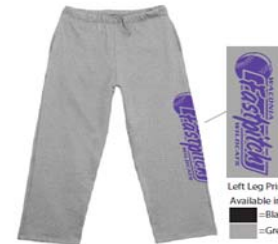
Open Bottom Sweatpants. Youth sizes S - XL = $20.00 Adult sizes S - 3X = $25.00