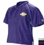
Mizuno Premier Piped Short Sleeve 1/4 Zip Pullover Youth Sizes M - XL = $30.00 Adult Sizes S - 3X = $30.00