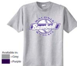
Available in: = Grey = Purple Short Sleeve T-shirt. Youth Sizes: S - XL = $12.00 Adult Sizes: S - XL = $12.00 XXL - XXXL = $13.50