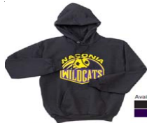
Hooded Sweatshirt Youth Sizes: S - XL = $23.00 Adult Sizes: S - XL = $25.00 XXL = $26.00 - XXXL = $28.50

Waconia Community Education now offers apparel for Soccer, Baseball & Softball players, parents and fans! Items include team bags, jackets, sweatshirts, shorts, shirts and more! To check out all of the items available for purchase please view our website at www.waconiacommunityed.org , click on the purple Youth Recreation Crayon, select Athletic Apparel and your sport! Sample sizes are available to try on at our office Monday-Friday 7:30am-4:00pm. Contact Holly at 952.442.0612 or hwortz@waconia.k12.mn.us with questions.