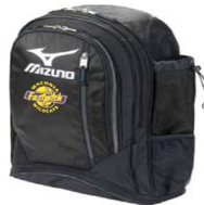
Mizuno Organizer G2 BatPack $45.00